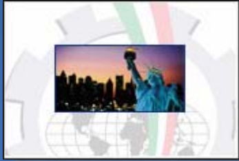
New York, NY