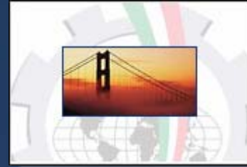
San Francisco, CA