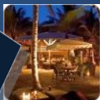
Miami Epoque Hotel